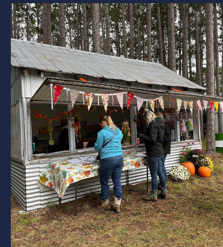
Horse Show Building