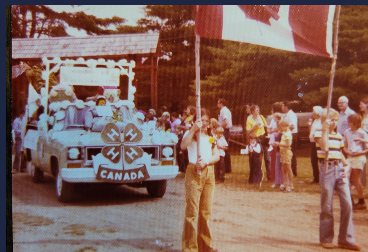
4-H Parade Float September 7, 1974