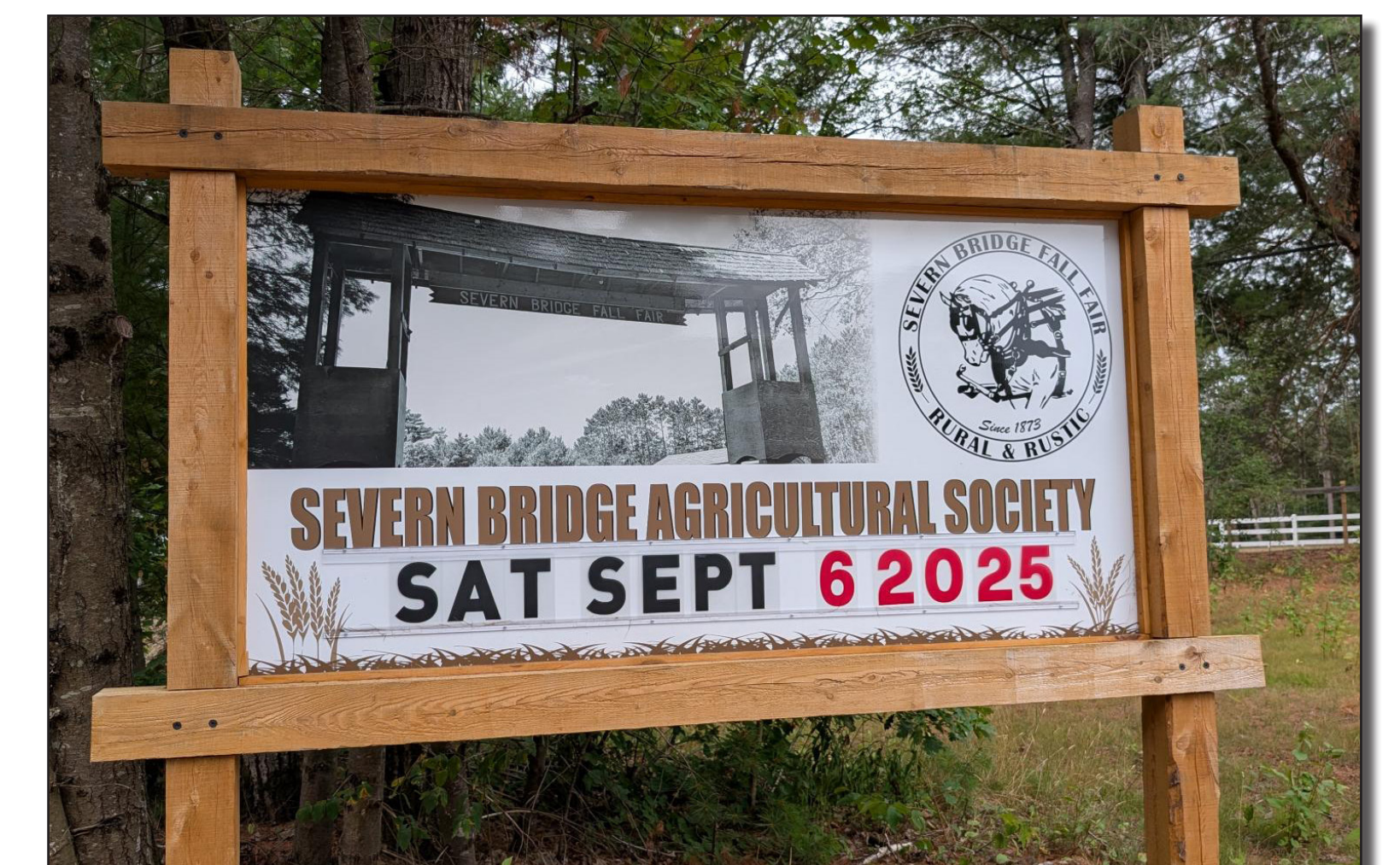
Welcome to the Severn Bridge Fall Fair!

In 2025, the Severn Bridge Fall Fair celebrated 150 Years of rural heritage. The theme "A Walk Through Time" honoured the Fair's history and the enduring spirit of Severn Bridge.