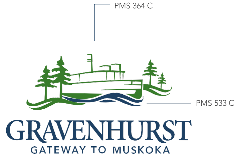
PMS 533 C

PANTONE® is a registered trademark of Pantone, Inc.