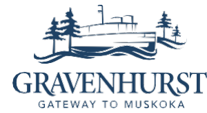
PMS 533 C